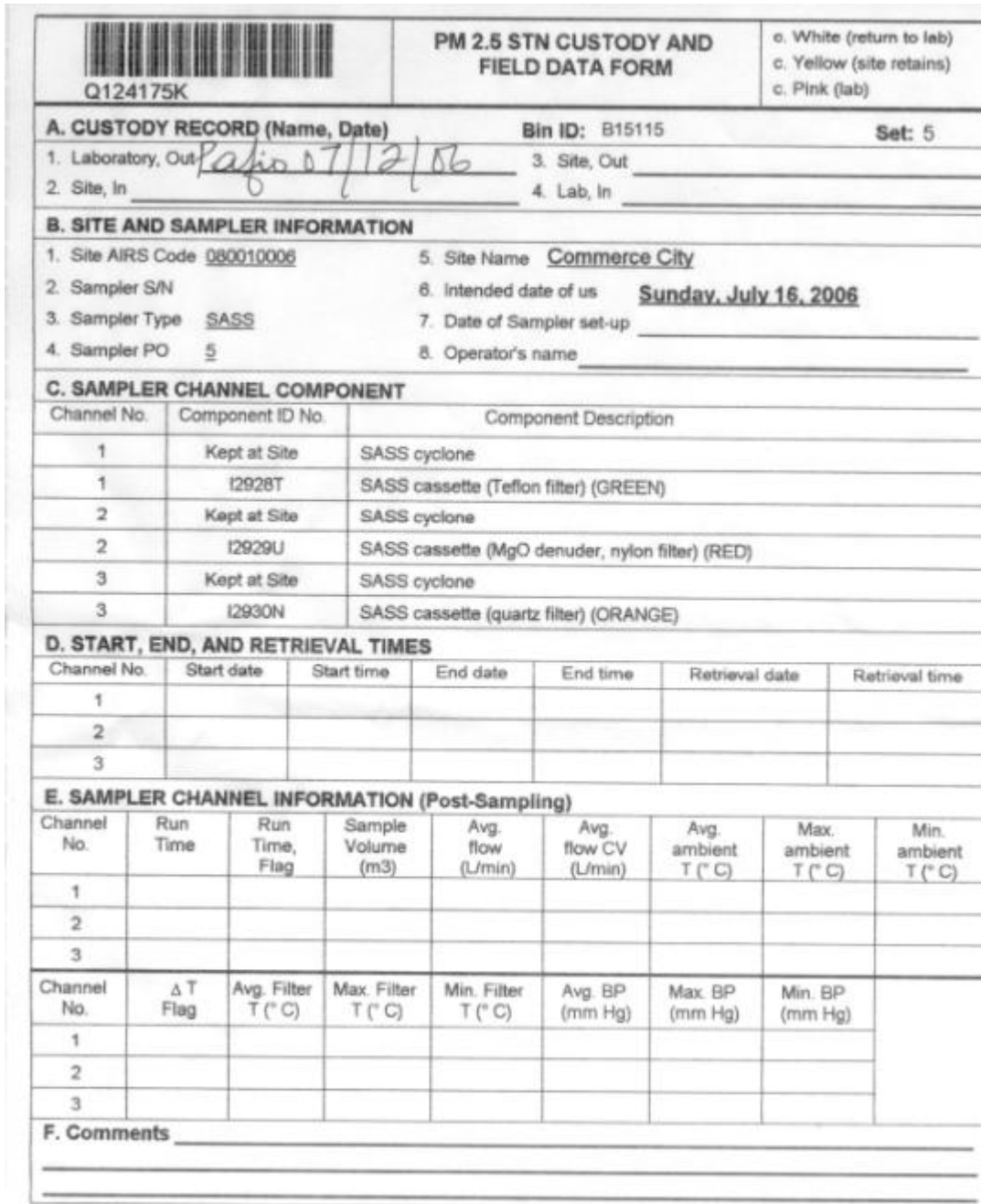
Figure EOD-1 PM 2.5 STN Custody and Field Data Form (SASS Field Form)